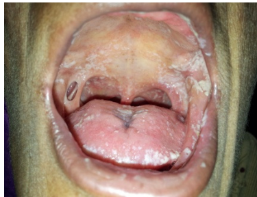
Fig 1. Extensive oral candidiasis with anterior faucial pillar perforation

The prevalence of oral candidiasis among AIDS patients is estimated to be between 9% and 31%. There have been seven reported cases of gastrointestinal perforation associated with Candida infection, 1 most of which were immune compromised patients. There has been no reported case of invasive oral candidiasis.