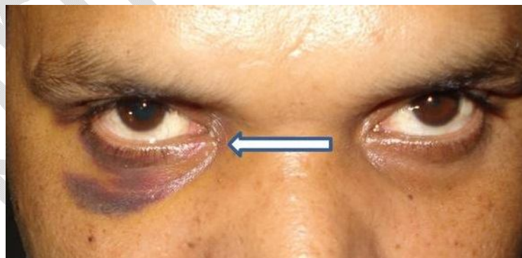
Fig 1. Barely visible entry wound of the pellet (arrow)

Our case highlights that deep penetration by Low Energy Missiles is not necessarily limited to children and can occur even in adults. Tissue characteristics of the areas coming in the path of the projectile will decide the depth of penetration and damage. Further, results of thoughtfully decided conservative management may be more rewarding than hasty retrieval of the projectile, as illustrated by our case. We recommend enactment of suitable laws and creation of awareness in masses about potentially injurious nature of air rifles/ air guns for prevention of such injuries.