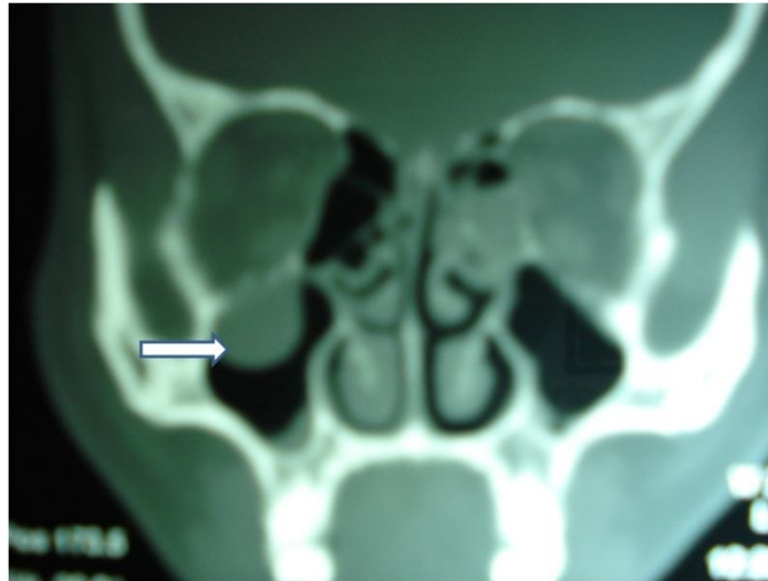
Fig 4. Coronal CT image showing herniation of soft tissue through the floor of Rt orbit (arrow). Destruction of ethmoid cells with air trapping is also seen.